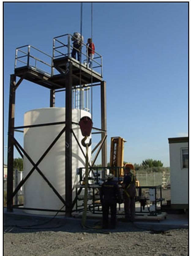
Client: NuVision Engineering (AEAT) Richland, WA

The test configuration, including the assay system piping and hose run lengths and elevations, was designed to mimic in-plant conditions to the extent possible.